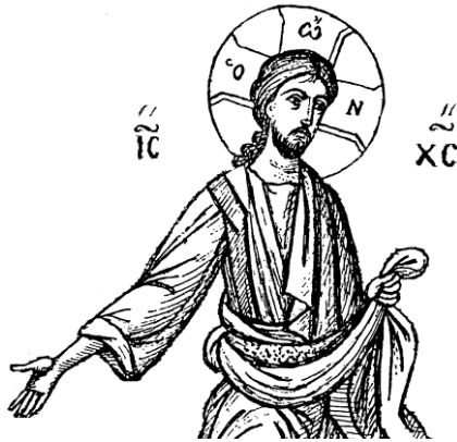
Christ the Sower sows the word of God